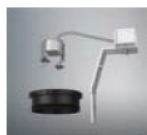
ACOT-82 MR16 Accessory kits