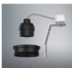
ACOT-83 GU10 Accessory kits