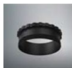
PJ-0079 MR16&GU10 Accessory